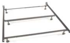
Metal Frames with adequate centre support for Queen & King Mattresses to be paired with a TEMPUR approved foundation