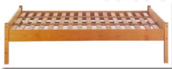
Slat bases – no more than 2" (5.08 cm) between slats