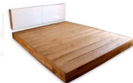
Platform bases – provide solid flat surface