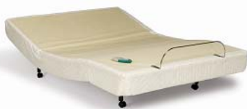
Tempur Approved Adjustable Base (not suitable for profiles larger than 10")