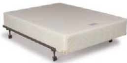
Tempur Approved Foundation